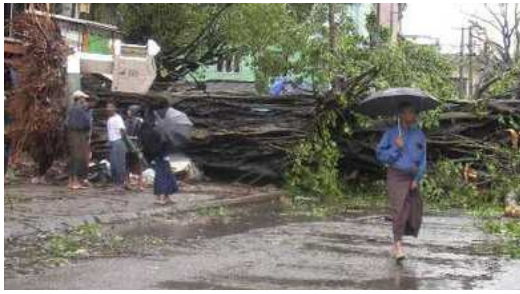
A man walks past an uprooted tree in central Yangon.

The powerful cyclone Nargis, packing winds of 190 km (120 mile) per hour, hit Myanmar on Saturday, 3 May 2008, killing at least 4,000 people, some sources even talk of more than 10,000 deaths. The cyclone also damaged more than 20,000 houses, leaving more than 100,000 people homeless, felled trees and powerlines and