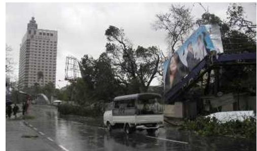
Damages in the roads of Yangon.

“The cyclone that affected Yangon has left the city and surrounding area without basic infrastructure. Water and electricity supplies are cut off. Unofficial versions mention that city electricity power lines are destroyed in more than 90 percent, including high tension main power lines that supply the city”, Cesar Russo, logistician of Malteser International in Yangon, reports. “Damage to buildings is substantial in Yangon and surrounding areas; most of the wooden constructions have been destroyed or seriously damaged”, he says. “A big number of people have sought refuge in monasteries and school buildings. Shortages of food, bottled drinking water and fuel are evident and prices are on the increase.”