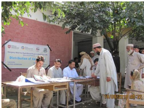
Distribution of cash grants to flood affected families in the Swat District

Malteser International also continues with the distribution of food and cash grants so that people can buy food from the local market, as well as kits with relief and hygiene items and drinking water. It was even able to extend the distribution activities to further affected areas of the Swat District. The distribution targets those that have been most affected by the floods.