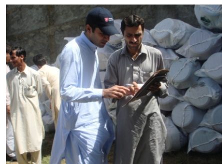
Distribution of relief kits to flood affected families