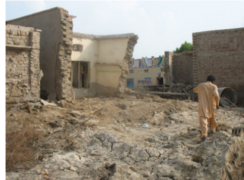
A destroyed village in Punjab: rebuilding life between ruins and mud

In Punjab, the assessment is now finished. Malteser International will start activities in Rahim Yar Khan which is located in southern Punjab. By now, the local staff for three medical teams that will support governmental health facilities is being recruited. Comparable to the precaution measures in Swat and Kohistan, three diarrhoea treatment centres will be set up for the case of an epidemic of acute watery diarrhoea.