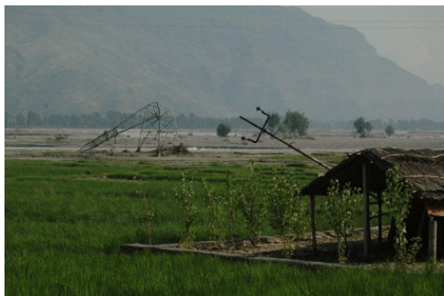
Much has to be rebuilt.

In the future, Malteser International will be active in the fields of rehabilitation and reconstruction, health and disaster preparedness. Project areas will definitely be Swat and Kohistan comparable to the emergency relief phase, but also Azad Jammu and Kashmir. The decision about a commitment in additional regions will be made after having analysed the emergency relief activities.