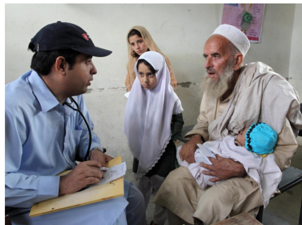
A Malteser International doctor in Kokarai.

Further funding is provided by the German Federal Foreign Office and the German Federal Ministry for Economic Cooperation and Development, the World Health Organisation and other organisations via the UN Cluster System.