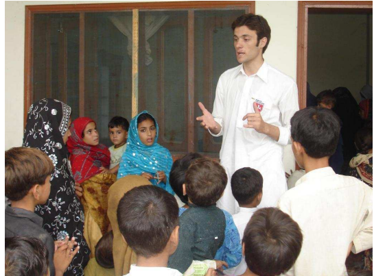
Hygiene awareness session with the community in Gulibagh