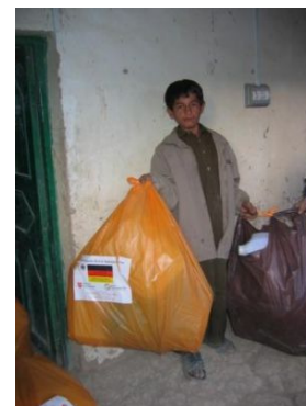
Distribution of aid in the aftermath of Pakistani earthquake

After the severe earthquake of 28 October in the north of Belutchistan, Malteser International has distributed winter sets with tarpaulins, woollen blankets and warm clothing, household and hygiene sets with drinking water containers and purification tablets to 580 families. Many people have lost all their belongings after the earthquake. In the Ziarat District alone, more than 50,000 people have been affected by the consequences of the earthquake. The earthquake relief of Malteser International is supported by the Federal Foreign Office of Germany and ADH (Action Campaign Germany Helps).