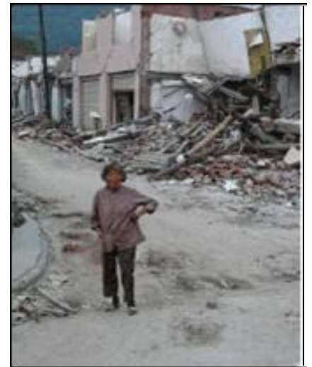
Earthquake aftermath in China

Malteser International in cooperation with Caritas International and the Chinese partner organisation Jinde Charities supports the reconstruction of an old people’s home in Gu Cheng in the province Sichuan. During the severe earthquake in May 2008 in China more than 70,000 people died and 5.8 million were made homeless. Besides schools and other social institutions also several nursing homes were destroyed. With the construction of this new old people’s home, 79 poor elderly people - already chosen - from the surrounding cities will get an adequate home. There will also be created additional capacities for further victims of the earthquake. Due to the one-child-policy in China many old people are alone and urgently need support. – This project can only be realised thanks to the generous donation of an internationally renowned German company.