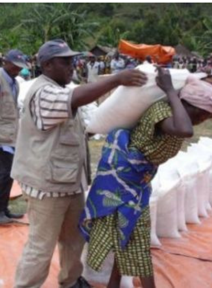
Malteser International distributes food for 30,000 IDPs in Minova