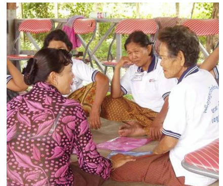
Training course for ladies in a Cambodian village

The TBA training focuses on the importance of referring women to the health centres for safe delivery conducted by health centre staff. However, there are several barriers preventing women from travelling to health facilities, such as lack of transportation, transportation costs, long distances and poor road conditions especially during the rainy season. Therefore, the training also in-