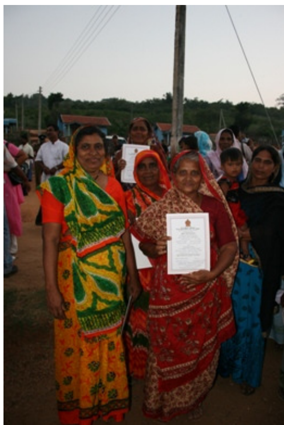
Women presented with the certificates proving their ownership of new houses and land deeds.

With a solemn ceremony attended amongst others by the Sri Lankan minister for cooperatives, Malteser International handed over 26 houses together with the relevant land ownership certificates to families in Karimalaiyoothu who had lost their houses and all their belongings during the tsunami in December 2004. In this village at the east coast of Sri Lanka, Malteser International, together with its local partner „Trincomalee District and Development Association“ (TDDA) and with financial support of „FC Bayern hilft e.V.“, furthermore constructed a community hall and a playground for the children of the village. All the houses have their own toilet as well as access to drinking water and electricity.