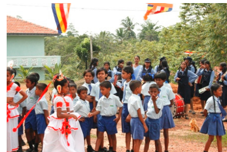
Children attending the festivities in Kosgoda at the opening of the school.

In Kosgoda, a village at the west coast of Sri Lanka, the last buildings within a large tsunami resettlement project have now been inaugurated: a children's homes and a playground. Between 2005 and 2008, the village received 50 new houses for families who lost all their belongings during the tsunami, a pre-school, a college, a medical centre, another children's house welcoming six girls, a community hall and a vocational training centre where young people can learn the professions of cook, carpenter, automobile mechanic, electrician and tailor. Up to now, more than 100 young people have started their vocational training. Many of them have already found jobs in the surrounding area. The new children's house – built with financial support of Stadt Wesseling (Germany) – will accommodate another six girls, as soon as the government will have inspected the new facility.