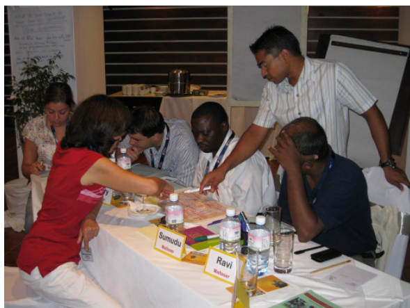
Annual Meeting Asia in progress

Hikkaduwa, a village in the south of the Sri Lankan island that has also been hit by the tsunami in December 2004, was the venue for this year's „Annual Meeting Asia“ of Malteser International bringing together the senior staff members of the organisation's projects in Asia. From 12 to 14 November, the staff discussed current subjects of humanitarian aid, exchanged experiences and lessons learnt and worked on new concepts. One of the focal points was disaster preparedness and disaster risk management. Additional workshops and field visits on the subject of water, sanitation and hygiene (WASH) completed the programme.