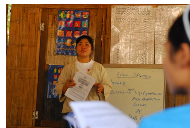
Presentation of certificate after an avian flu training course.