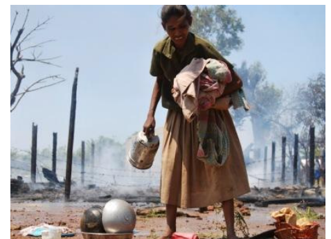
A refugee collects her belongings

the camps, volunteers identified among the IDPs are being trained in basics of health care and hygiene. They will then inform the IPDs about the dangers of infectious diseases, and how the spread of them can be avoided. Despite these interventions and others, the situation in the camps is deteriorating, and people do not have enough drinking water and food. The twin threats of starvation and disease are ever present.