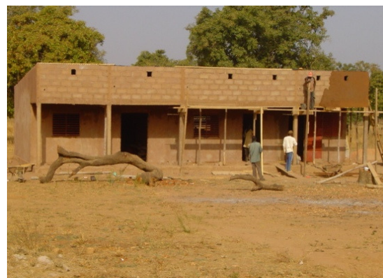
A school and storehouse, constructed for the benefit of local farmers.

Malteser International and Germany's Relief Coalition (Aktion Deutschland Hilft) recently provided funding for a project of the French Association of the Order of Malta in Burkina Faso. The project provided support to people affected by the floods in the village of Kadomba in the south-west of Burkina Faso for the reconstruction of their houses and the construction of community buildings. The project was carried out by the Emergency Centre of the Order of Malta in Burkina Faso. A total of 12 houses (one for each household affected) were built providing residence and kittens. A school was also built for the formal education of farmers,