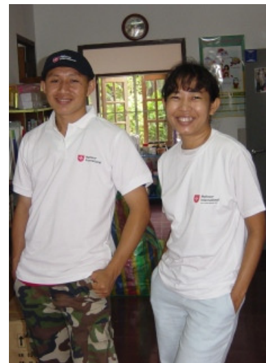
Malteser International staff from a Thai village team

Malteser International in cooperation with the Thai district health authorities will implement disease awareness and prevention campaigns among refugees and in surrounding villages. The district hospital, the health centres and clinics in Sop Moi will be provided with the necessary equipment or rehabilitation measures. All these activities together will make a significant and positive contribution towards a joint approach of NGOs and the Thai health system for improved practice and behaviour in the field of health care.