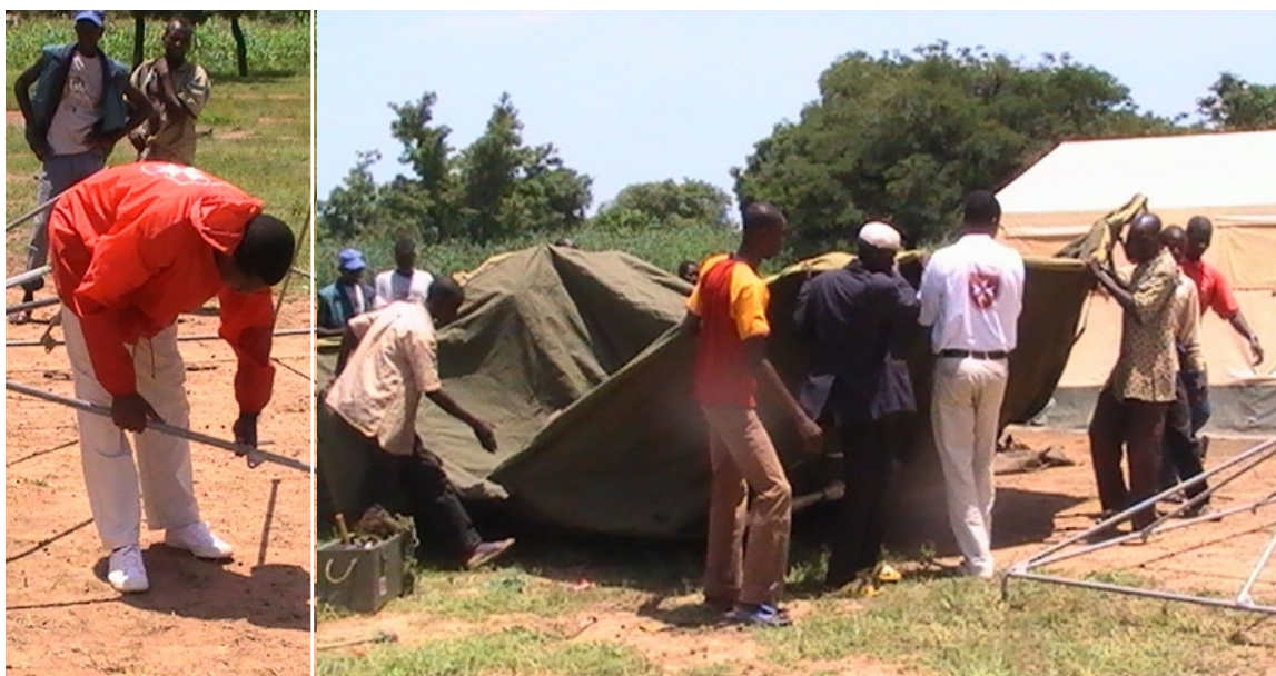
Order of Malta France workers erect temporary tent constructions to benefit victims of the flooding in Kamdomba, Burkina Faso.