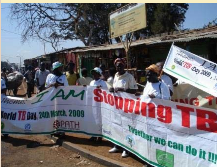
TB awareness raising in Rumbek.

World Tuberculosis Day on 24 March 2009 was celebrated in Malteser International projects with a variety of awareness raising events.