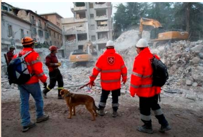
Relief workers of the Order of Malta in L'Aquila.

Immediately after the catastrophe CISOM, the Relief Corps of the Italian Association of the Order of Malta, sent relief workers to the affected area.