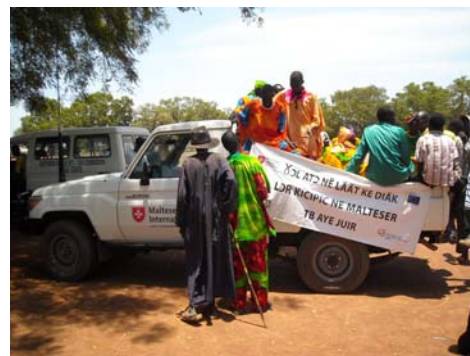
TB information unit in Kenya.

In Nairobi the day was celebrated in the Kibera slums where Malteser International operates through the African Medical and Research Foundation (AMREF). Malteser International was recognized for its immense contribution in TB control in Kenya and contributed T-shirts to the occasion. Nurses and community health workers participated actively by giving speeches on TB. On this occasion Kenya was recognised for realising the WHO targets of 70% case detection rate and treatment success rate of 85%.