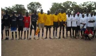
TB Fighters Football Club in Rumbek

Under the slogan “I am stopping TB” the action days seek to inform about cause, transmission, treatment and prevention of tuberculosis.