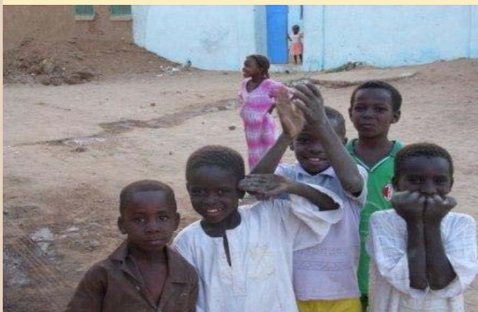
Health education and awareness raising to prevent the outbreak of diseases in North Darfur.

In March Malteser International has trained 60 volunteers in Shangil Tabayi in North Darfur on personal hygiene, food hygiene, safe water and meningitis prevention as a reaction to an increase of diarrhoea cases in the region. After the trainings participants visited about 3,600 households in the rural area for awareness raising purposes. After violent clashes in Wada in February 37 Community Health Volunteers were trained and conducted house to house sessions to prevent the outbreak of diseases.