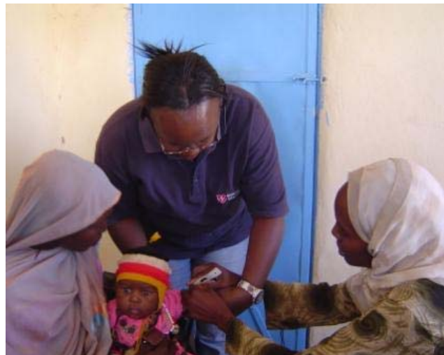
Community health volunteer trained by Malteser International.

As part of regular community health education in the months of February, March and April 433 Community Health Volunteers were trained on nutrition and 354 Community Health Volunteers participated in awareness raising sessions on Immunisation and Ante Natal Care.