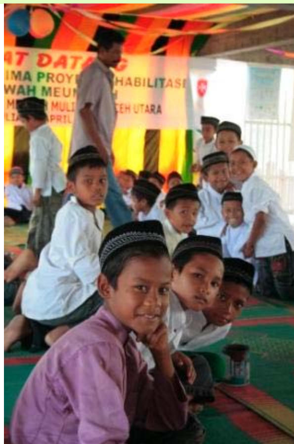
Inauguration of new premises in Aceh Utara /North Sumatra.

This kindergarten and rehabilitated community hall is the foundation for further activities in the community and an important step to strengthen community activities in the former conflict area and hinterland of Aceh Utara in North Sumatra.