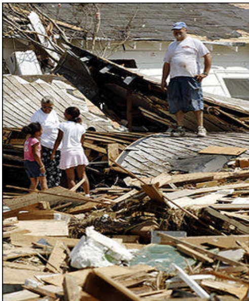
Devastation in Biloxi

Malteser International supports the appeal of the United States Associations of the Order of Malta to raise funds and secure the financial ability of the Associations to respond to the crisis: “Please contribute whatever you can. We are hoping that the monies raised by our three United States Associations, coupled with the funds and efforts of Malteser International, will make a strong impact, and will help many of the poor and suffering people in this region. With your donations the Order will make disbursements after developing a needs assessment and a rehabilitation program.”