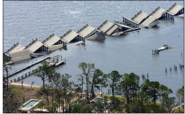
Bridge over St. Louis Bay, Mississippi

Malteser International has already pledged $100,000 in order to support possible relief activities of the United States Associations of the Order of Malta. A team of Malteser International emergency experts is on call to travel to the United States. The team is prepared to offer capacity building for needs assessments and to support the rehabilitation measures of the United States Associations of the Order of Malta.