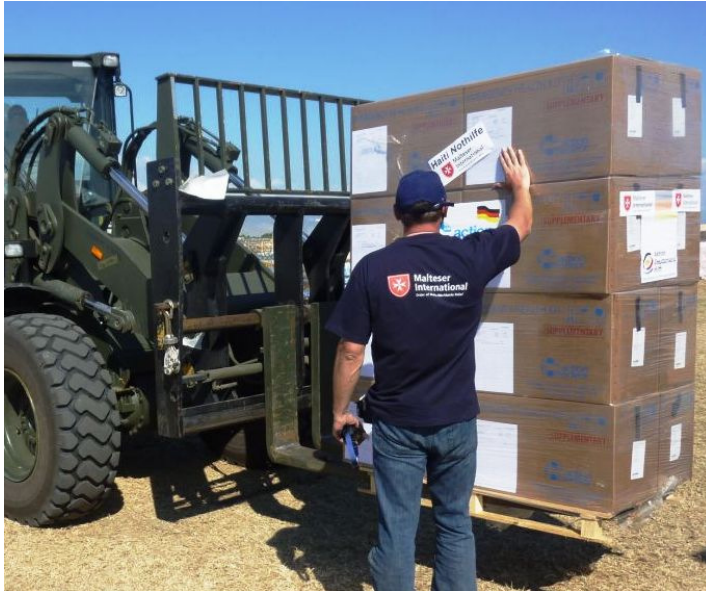
Arrival of relief items in Haiti

From Saturday (23 January) onwards, Malteser International will have 11 staff available on the ground: